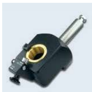
Tool holder SK